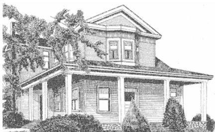
Celebrating 30 Great Years!

This year we have five area homes that represent the growth and development of the Milford area. Visitors will gain an understanding of how older homes can be renovated to accommodate a 2006 lifestyle while preserving the home's character and charm. Viewing the design and decorating ideas in this year's homes will be a real treat. Want to take a sneak peek? In the Village, drive by 608 E. Commerce, 605 Hickory, and 633 Union. Then head west on Commerce Road into Milford Township passing our next home at 2095 W. Commerce and turn left on Grand Vista seeking the home at 514. Watch the Milford Times and our next newsletter for more details on this year's exciting homes.