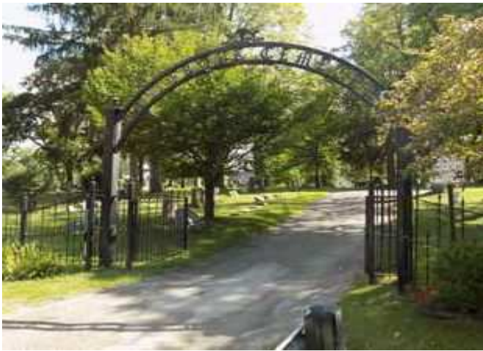
Oak Grove Cemetery