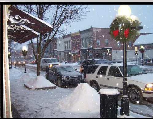
1-11-2010 West side of Main Street Looking South