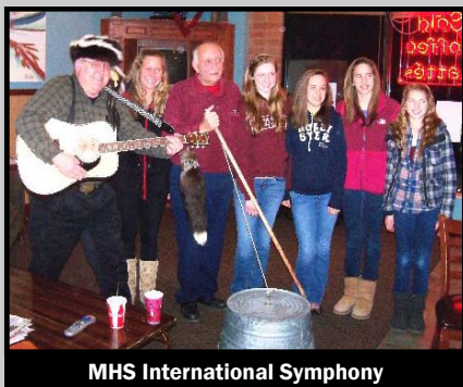
MHS International Symphony