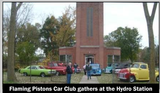
Flaming Pistons Car Club gathers at the Hydro Station

Other events included a full-blown July wedding with an overflowing number of guests and a special visit from the Flaming Pistons , a vintage car club. The entire area surrounding the Hydro Station was filled with old cars! What a thrill to have their cars photographed in front of Henry Ford's Pettibone Creek Hydroelectric Power Station.