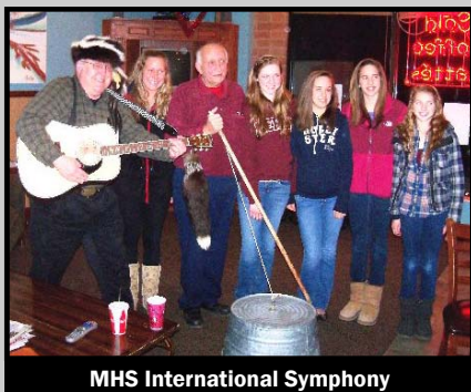
MHS International Symphony