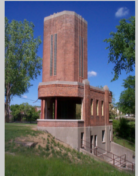
Pettibone Creek Hydroelectric Station