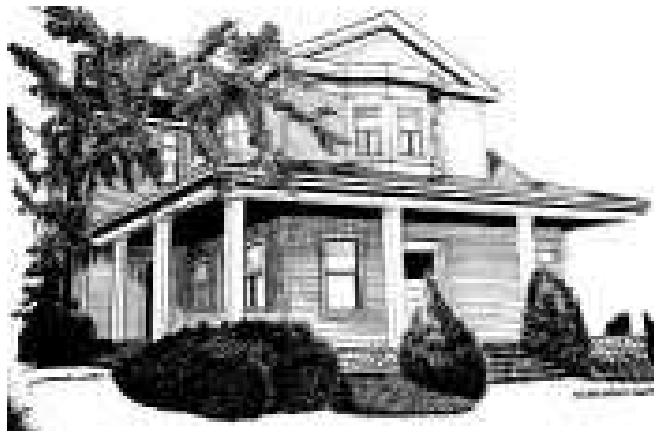
Celebrating 30 Years!

Sue Gumper reports that our 30 th Home Tour weekend was highly successful. We sold 570 tickets and free tickets were provided to approximately 250 docents/entertainers. Revenue sources included: Home Tour ticket sales, $6827.00; Home Tour Sponsorship Program, $2,039; Make Over Magic $210; and Dine Around ticket sales, $240. Subtracting expenses, our total net profit for Home Tour 2006 was $8,199. This is the major source of funding for maintaining and operating the Milford Historical Museum. These funds also support other Society projects including student docent scholarships, microfilming of the Milford Times , and the Fourth of July parade.